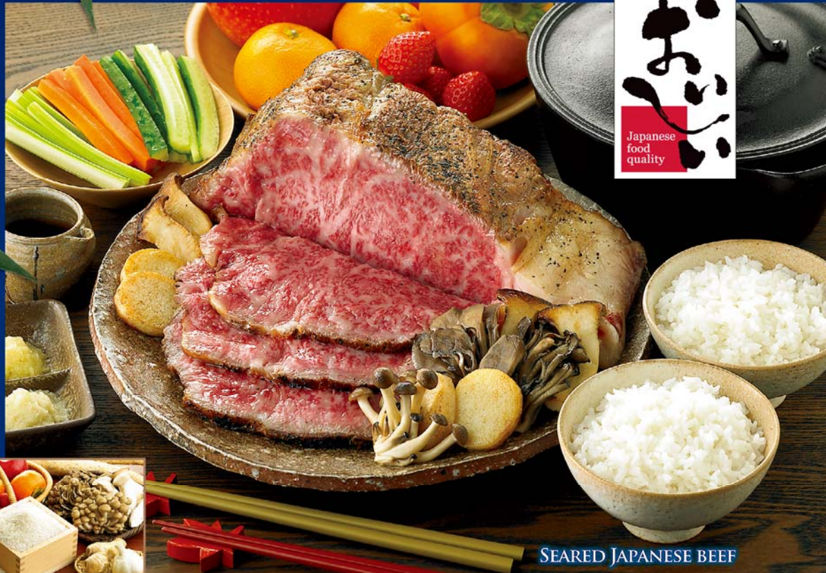
SEARED JAPANESE BEEF