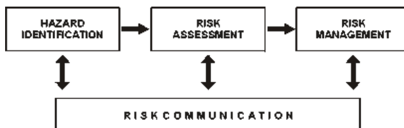
Fig. 1. The four components of risk analysis

The risk assessment is the component of the analysis which estimates the risks associated with a hazard. Risk assessments may be qualitative or quantitative. For many diseases, particularly for those diseases listed in this Terrestrial Code where there are well developed internationally agreed standards, there is broad agreement concerning the likely risks. In such cases it is more likely that a qualitative assessment is all that is required. Qualitative assessment does not require mathematical modelling skills to carry out and so is often the type of assessment used for routine decision making. No single method of import risk assessment has proven applicable in all situations, and different methods may be appropriate in different circumstances.