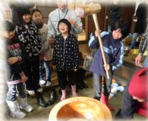
PHOTO: Preparation of rice cake (rice pounding) for New Year's celebration

WASHOKU has developed using traditional knowledge and customs closely associated with nature and a connection to annual events. It strengthens the bonds of family and community members when they share mealtime together, appreciating nature-gifted ingredients.