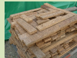
5) Dunnage made of particleboard