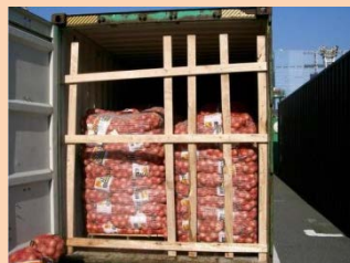
8) Wooden Pegs