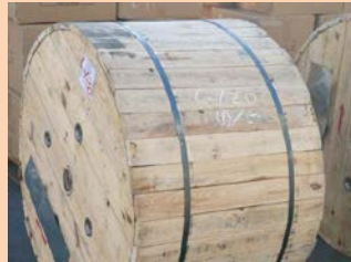
2) Wooden Drums