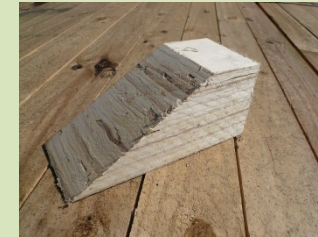
1) Wedges made of LVL (laminated veneer lumber)