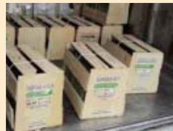
⑥ Wooden Crates