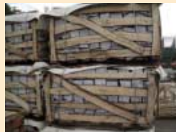
④ Wooden Crates