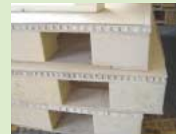
⑥ Pallets made from paper

Notice : These items do not require special markings.