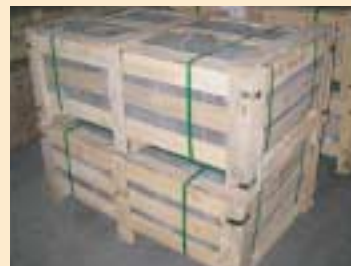
⑤ Wooden Crates