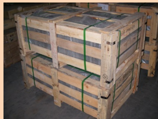
5) Wooden Crates