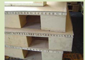
6) Pallets made of paper

Note : If not marked, the wood packaging materials will be inspected.