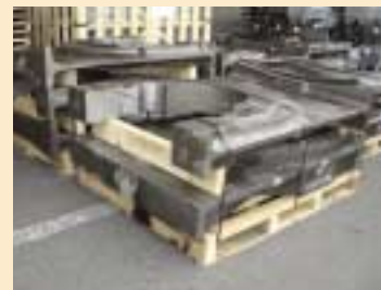
⑨ Wooden Pallets reinforced with Battens

Notice : If these items display the required markings, they need not be subjected to quarantine inspection.