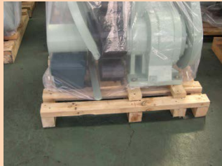
1) Wooden Skids