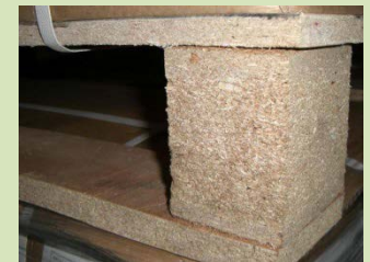
4) Pallets made of particleboard