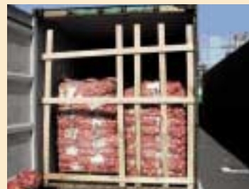
⑧ Wooden Pegs