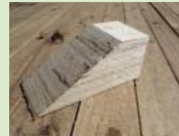
① Wedges made from LVL (laminated veneer lumber)