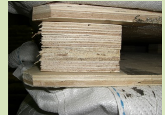
2) Pallets made of plywood