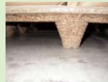
③ Skids made from particleboard