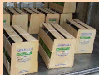
6) Wooden Crates