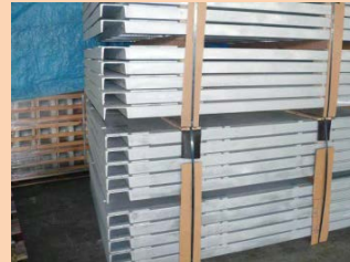
3) Wooden Battens