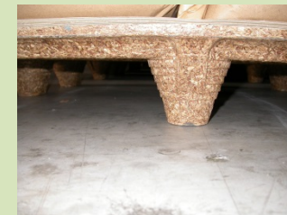
3) Skids made of particleboard