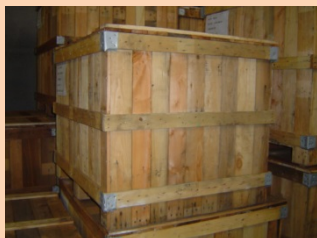
7) Wooden Boxes