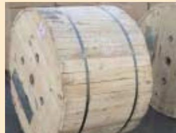
② Wooden Drums