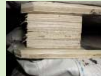
② Pallets made from plywood