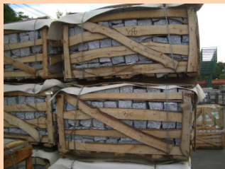
4) Wooden Crates