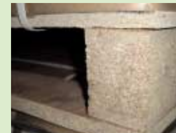
④ Pallets made from particleboard