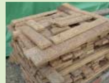
⑤ Dunnage made from particleboard