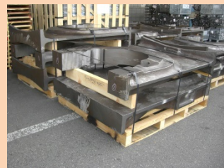
9) Wooden Pallets reinforced with Battens