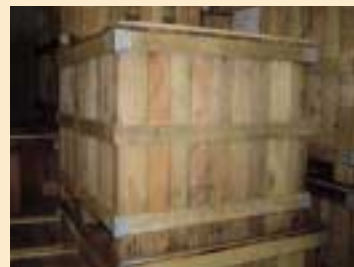
⑦ Wooden Cases