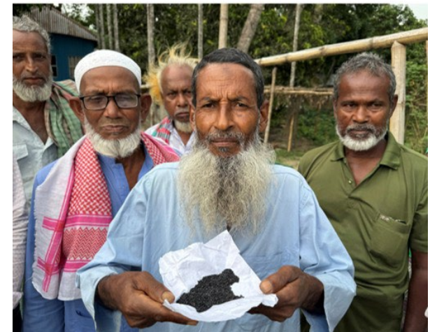
Local sesame farmers