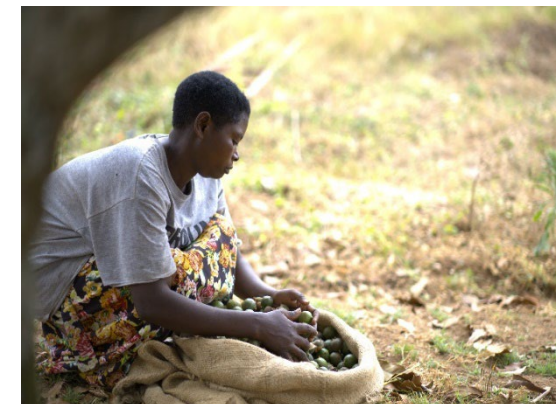
Harvesting macadamia nuts