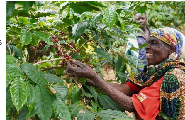
Local coffee farmers