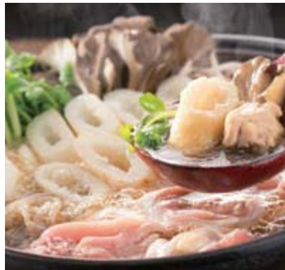
"Kiritanpo" Rice Stick Hot Pot