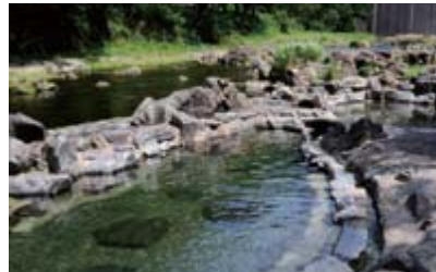
Bathing, either at a nearby onsen or at the host's home.