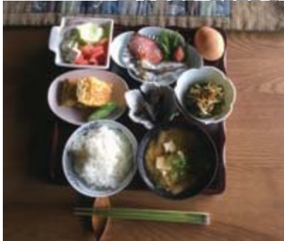
Wake up to the sound of birds singing and breakfast.