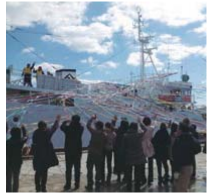
Giving fishermen a good send-off