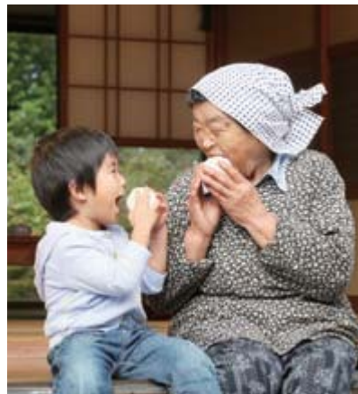
Grandma and grandson enjoying rice balls