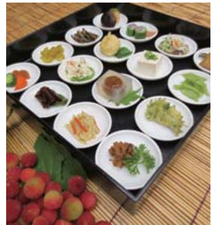
Seasonal specialties, served on small plates