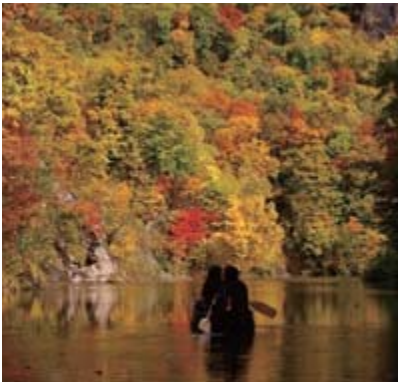
Canoeing in the foliage lake

Visitors can experience this culture and its fabulous food when staying with families that make their living from nature.