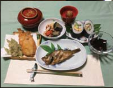
Typical dinner, made with local ingredients