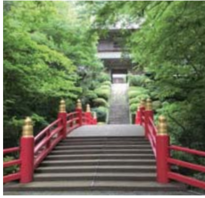
Entrance to the temple