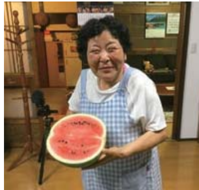
Water melon with grandma