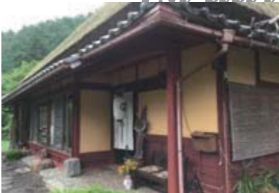
Farm stay house (exterior view)