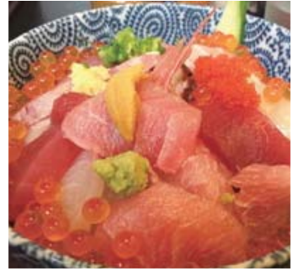
Seafood rice bowl