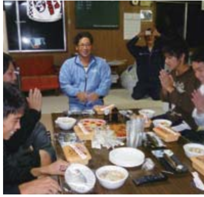
Dinner with fisherman's family