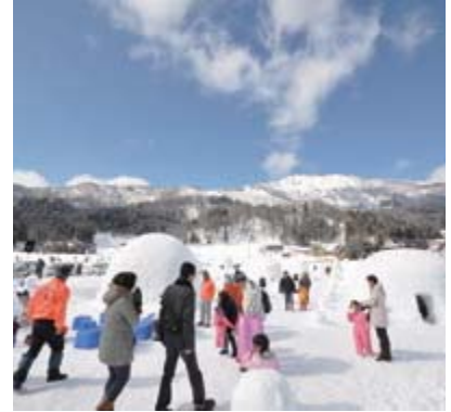
Snow dome cafe