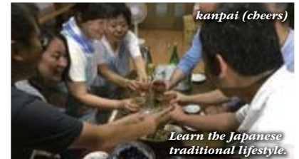
Learn the Japanese traditional lifestyle.

A post-meal gathering to get to know each other better.