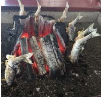
Grilling fish at irori fireplace