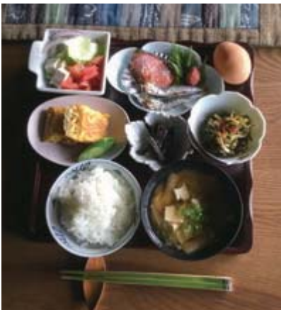
Traditional Japanese breakfast

Away from the hustle and bustle of Japan's cities, travelers will stay in rural villages that have relied on agriculture and fishing for centuries. Meet the local people face to face and live as they do, and enjoy the local cuisine. See how they get fresh vegetables from their own farm and cook their meals. Your hosts will choose typically local items, seasonal and representative of the area. You will be treated to the bounty of Japan's four distinct seasons.