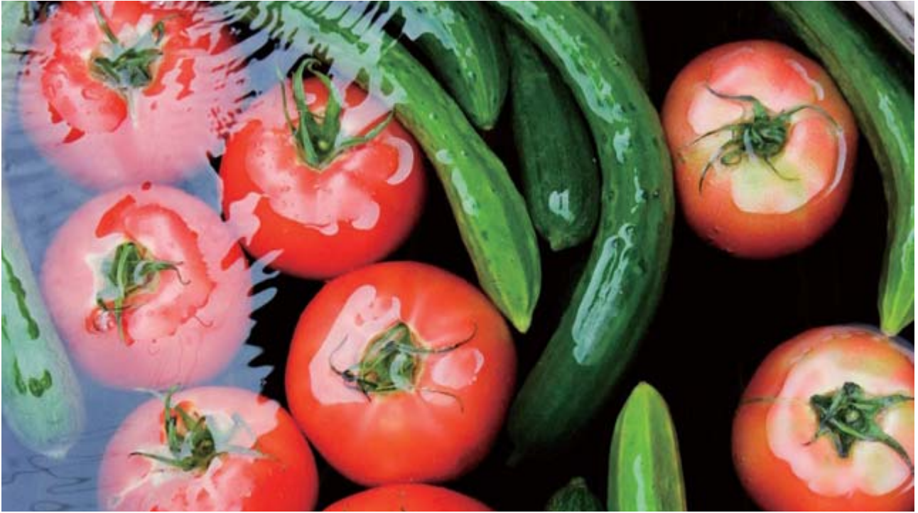
Cleaning vegetables soak them first in a basin of water