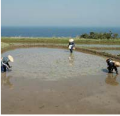
Transplanting rice seedlings