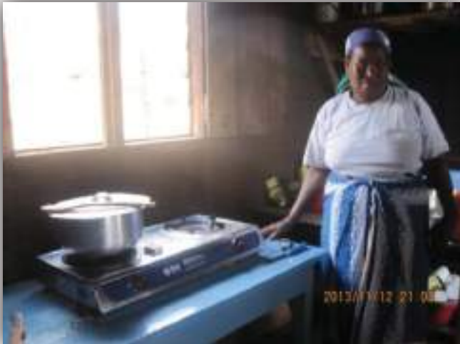
Gas Cooker using bio gas