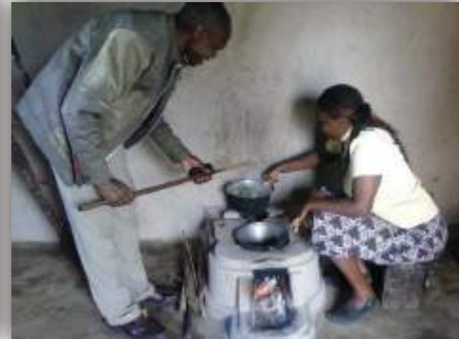
Energy Saving Jiko