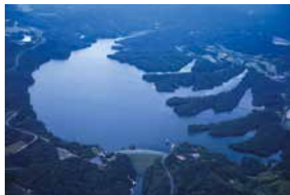
Manno-ike Reservoir