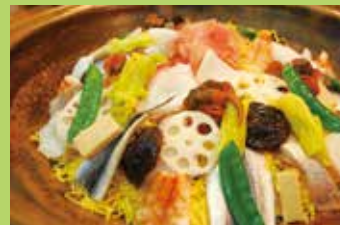
Kurayasu and Hyakken Rivers Irrigation and Drainage System (Barazushi scattered sushi)[Top 100 Rural Culinary Dishes]