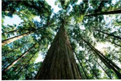
Owase City and Kihoku Town, Mie Prefecture (Owase Hinoki cypress)