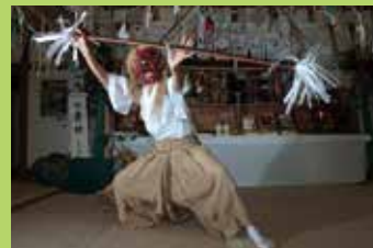
Takachihogo-Shiibayama region, Miyazaki Prefecture (Kagura)

Local history and traditions continuing today