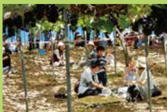
Tanzansosui Irrigation System (Tourist vineyard)