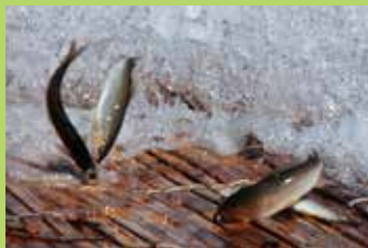
Upper and middle reaches of Nagara River, Gifu Prefecture (Ayu sweetfish)