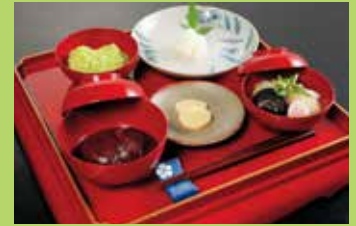
Teruzeki Irrigation Canal (full-course mochi dinner, Mochi honzen)