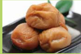
Minabe/Tanabe region, Wakayama Prefecture (Kishu Nanko plums)