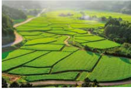
Kunisaki Peninsula Usa area, Oita Prefecture (Tashibu no Sho)