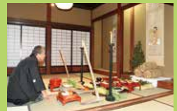
Noto region, Ishikawa Prefecture (Aenokoto agricultural ritual)