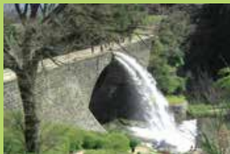
Tsujunyousui Irrigation System (Tsujun Bridge)