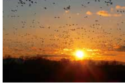
Osaki region, Miyagi Prefecture (White-fronted geese flying out in the early morning)