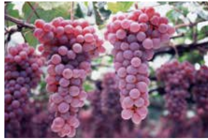
Kyoutou region, Yamanashi Prefecture (Koshu grapes)