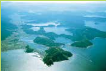
Mikatagoko region, Fukui Prefecture (Landscape)