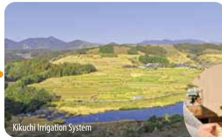
Kikuchi Irrigation System

Kikuchi's irrigation heritage, lined with beautiful waterway and stone houses, is a hidden photo spot that even professional photographers in Kumamoto don't know.