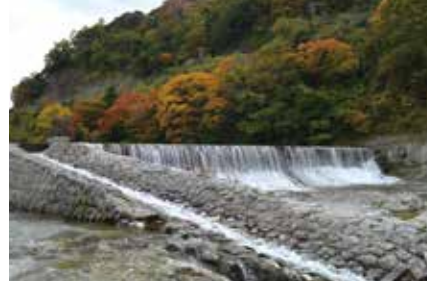
Tachibaiyousui Irrigation Canal (Tachibai Weir)