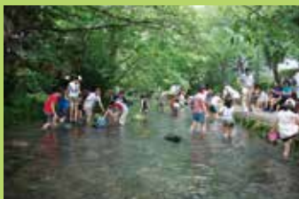
Genbegawa Irrigation Canal