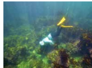
Toba and Shima regions, Mie Prefecture (Ama-Wemen d