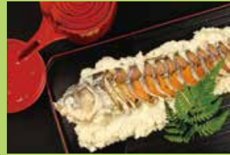
Lake Biwa region, Shiga Prefecture (Funazushi; fermented fish)