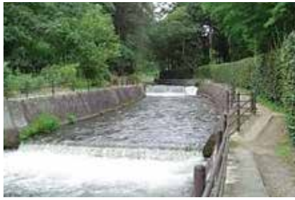
Uchikawa Irrigation System