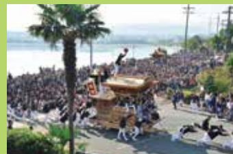
Kumedaike Reservoir (Gyoki Mairi Festival)