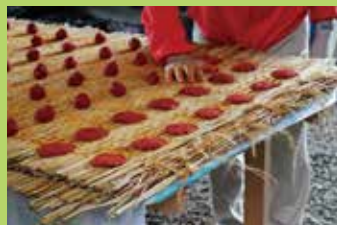
Mogami River basin region, Yamagata Prefecture (Safflower disc for dyeing)