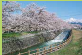
Jyosai-gokuchi Irrigation System