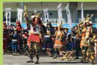
Tengujiwa Irrigation System (Soja Akimoto History Festival)