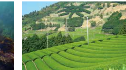
Kakegawa region, Shizuoka Prefecture (Chamoji tea character and tea fields)

gnated as a Japanese Nationally Important