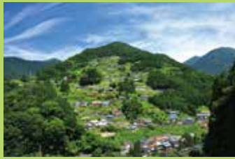
Nishi-Awa area, Tokushima Prefecture (Ochiai Village)

Beautiful, unspoiled Japanese landscapes