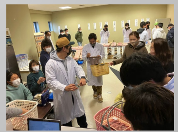
selling meat at the university festival