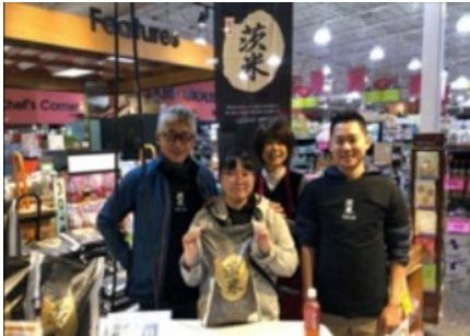
Local Sales Promotion Activities Conducted by Producers Traveling Abroad

They are actively expanding into regions where Japanese rice is not yet widespread (e.g., Mexico, Croatia, Israel) and can directly export to these areas.