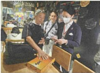
Promotion in Bangkok