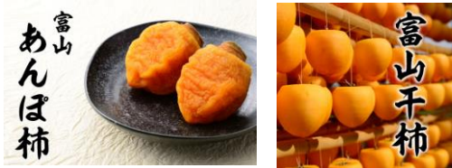
Main products Toyama Hoshigaki