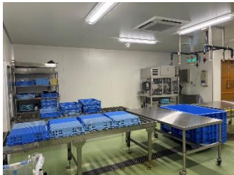
Ainan Fisheries Cooperative Processing ARTICLE