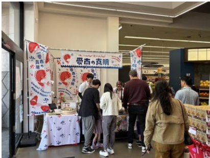
Ainan Fair in LA