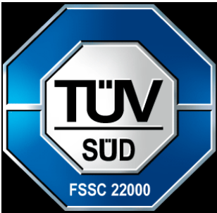
Certified for FSSC 22000 certification in June 2022