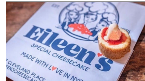
Used in a Famous New York Cheesecake

Aiming to become a model case for local producers and boost momentum for exploring additional overseas markets as a whole region.