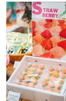
Scenes of Sales in Dubai