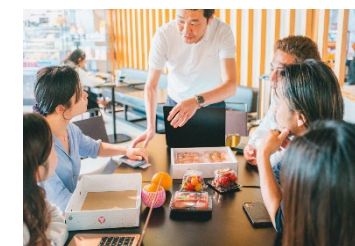
Checking Delivery Status with Local Buyers