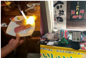
Promotion in hotels and restaurants (United States)