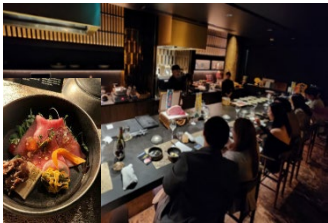
Promotion in high-end Japanese dining establishments (Australia)