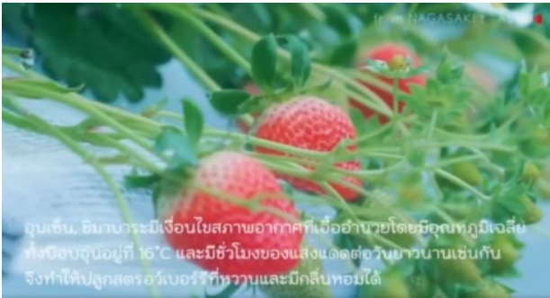
Creation of PR Videos in the Language of the Export Destination

Sales promotion activities include strawberry tastings at local stores, PR video screenings, and the introduction of gift boxes with designs for the Lunar New Year. Additionally, efforts are made to enhance recognition and evaluation of Nagasaki strawberries through the creation and distribution of production area maps, aiming to attract more customers.