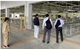
Facility Certification for Export to Thailand