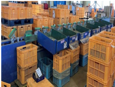
Participated in an Exhibition in Thailand and Created New Local Demand (for Export of Non-Standard Products)