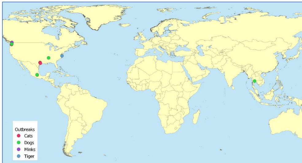
Figure 2. Worldwide recent distribution of SARS-CoV-2 outbreaks reported to the OIE (01/05/2021 - 31/05/2021).

During the last month 13 outbreaks have been reported by 5 countries in 4 animal species (cat, dog, mink, tiger). The recent distribution of outbreaks is reported in Figure 2.