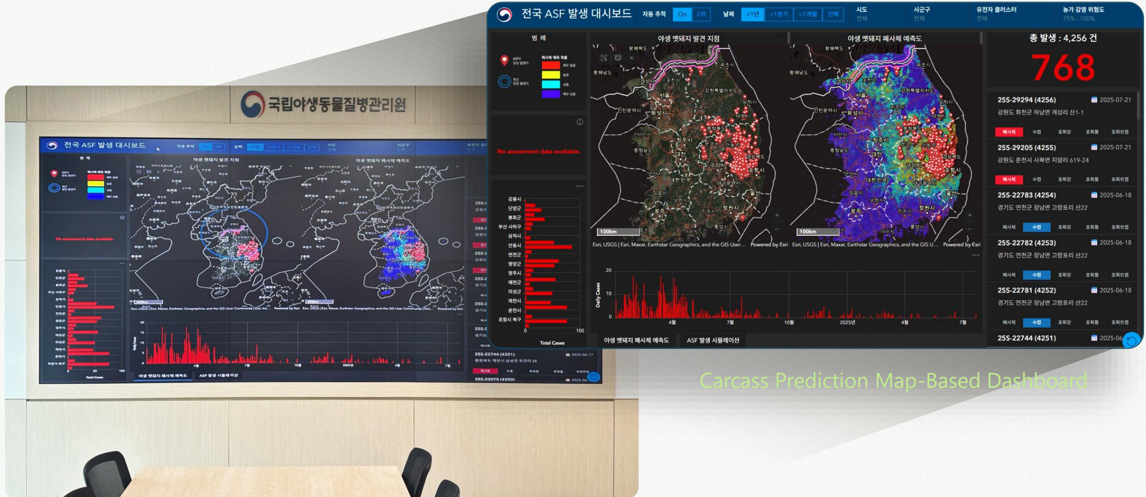
Carcass Prediction Map-Based Dashboard

Wild Boar ASF Outbreak situation Maps and Graphs