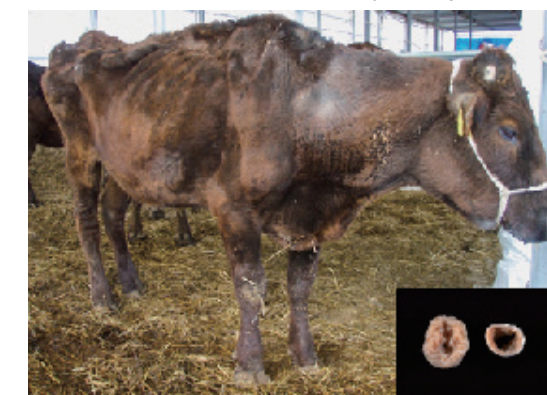
Figure2-3-2 Cattle with Johne's disease showing weight loss lower right: Cross-section of the intestinal tract of the cattle with Johne's disease (left) and healthy cattle (right)

Johne's disease surveillance is conducted through a combination of ELISA testing using serum, skin tests, real-time PCR of fecal samples, and fecal culture. A cumulative total of 684,206 cattle were tested for Johne's disease in 2022.