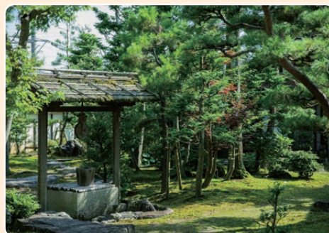
A soothing green setting