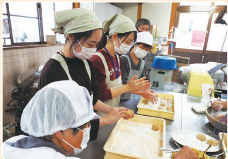
Make Japanese sweets with local grandmothers

One feature of this renovated traditional home is its traditional warmth and woodwork. Maibara, a secluded area in the mountains, is relatively cool in the summer yet mild in the winter. On clear evenings, the starry sky is a highlight.