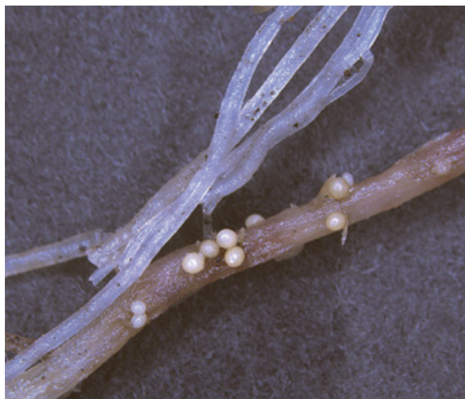
Cyst attached to the root