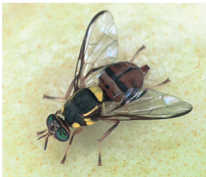
Bactrocera dorsalis species complex