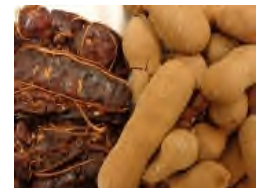
Tamarind dried fruit